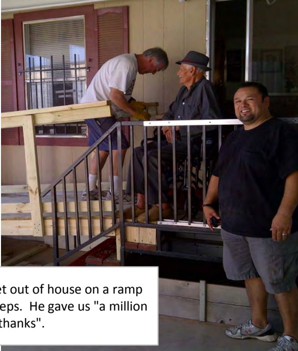
Much easier to get out of house on a ramp instead of steep steps. He gave us "a million thanks".