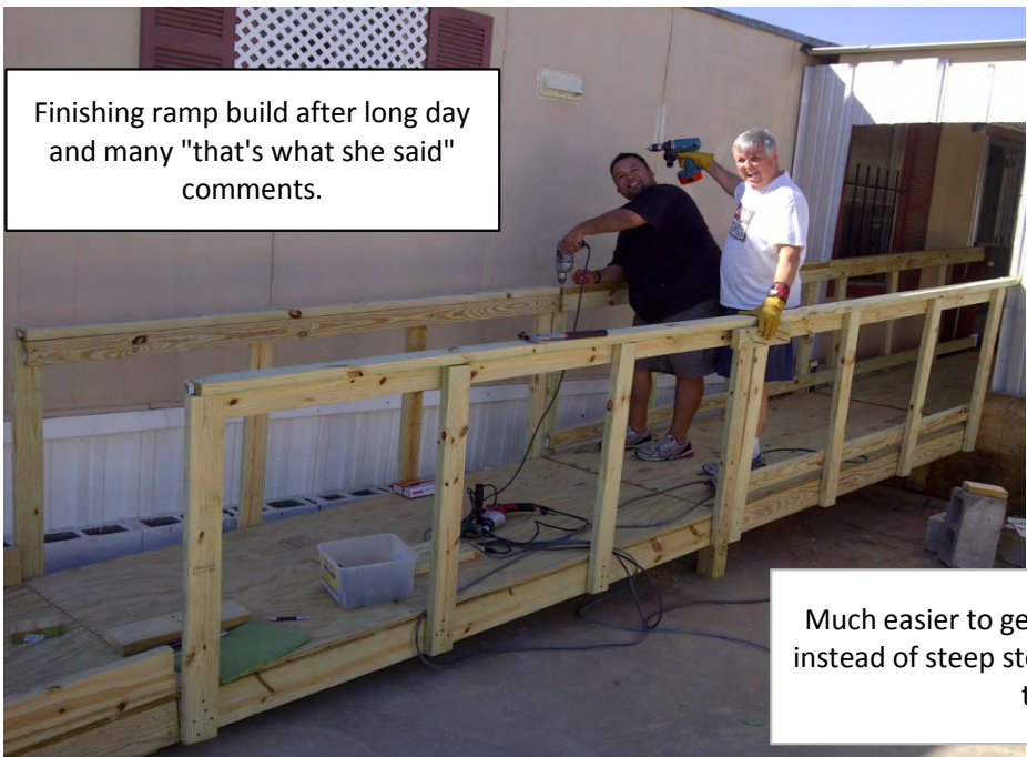
Finishing ramp build after long day and many "that's what she said" comments.